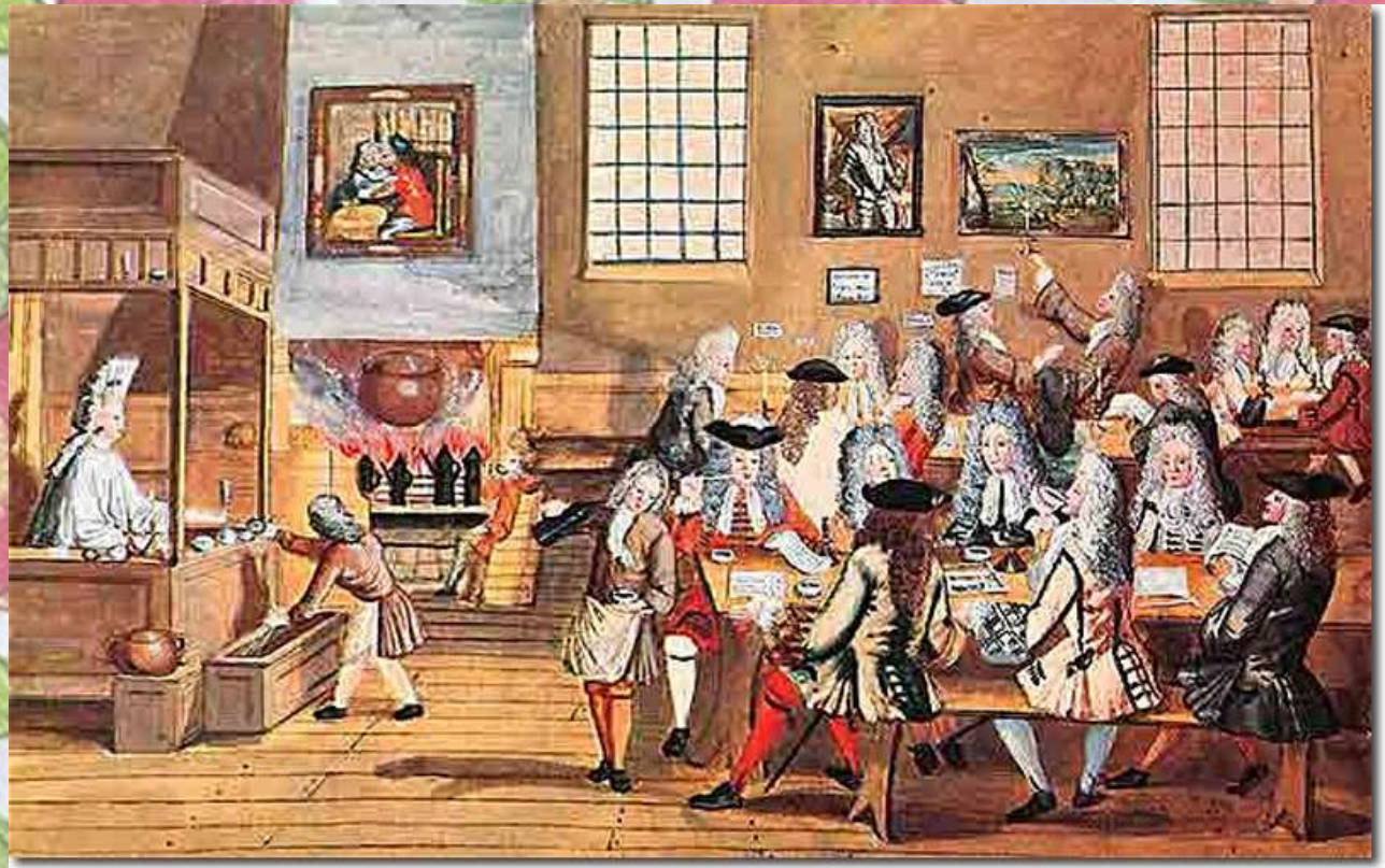
Rules and orders 1674