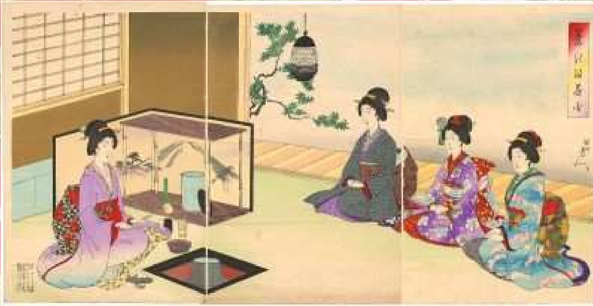
Japanese Tea Ceremony