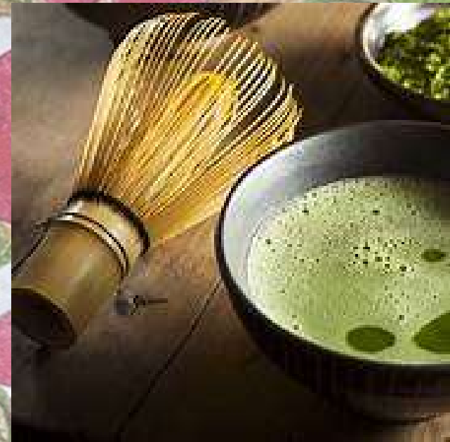
Matcha whisked tea