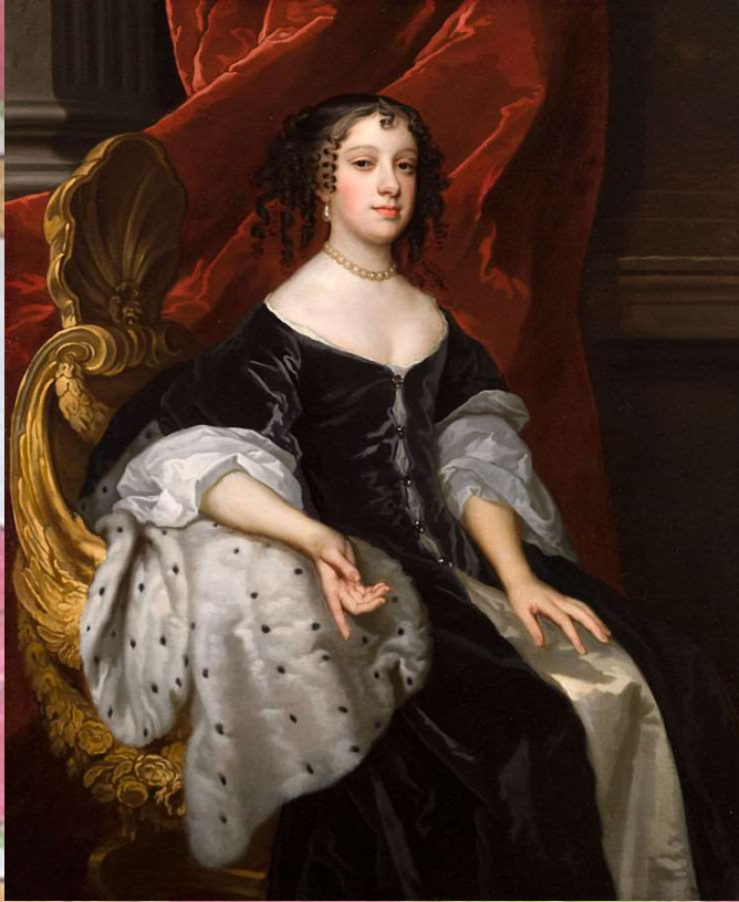
Catherine of Braganza