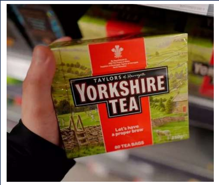
Britain's Favourite tea Daily Mirror, April 2024